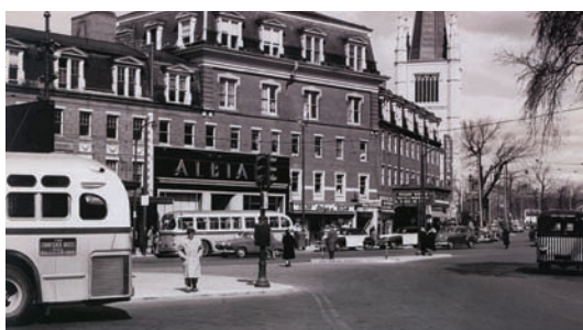
Harvard University Archives